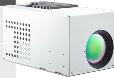
The R100 MC enclosure.