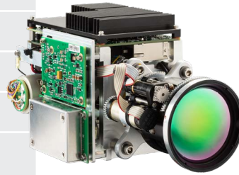
The R100 MC interior.